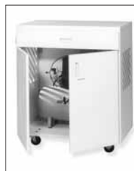
OPTIONAL PORTABLE ACCU-SEALER CART (SHOWN W/INDUSTRIAL COMPRESSOR)

The Accu-Seal Model 730 Validatable Sealer was designed, built, and tested to give years of reliable, trouble free service.