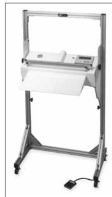
OPTIONAL ERGONOMIC MULTI-POSITION ACCU-SEAL STAND (SHOWN W/ MODEL 635-232)