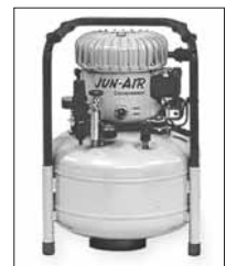
OPTIONAL ULTRA-QUIET LAB/OFFICE COMPRESSOR